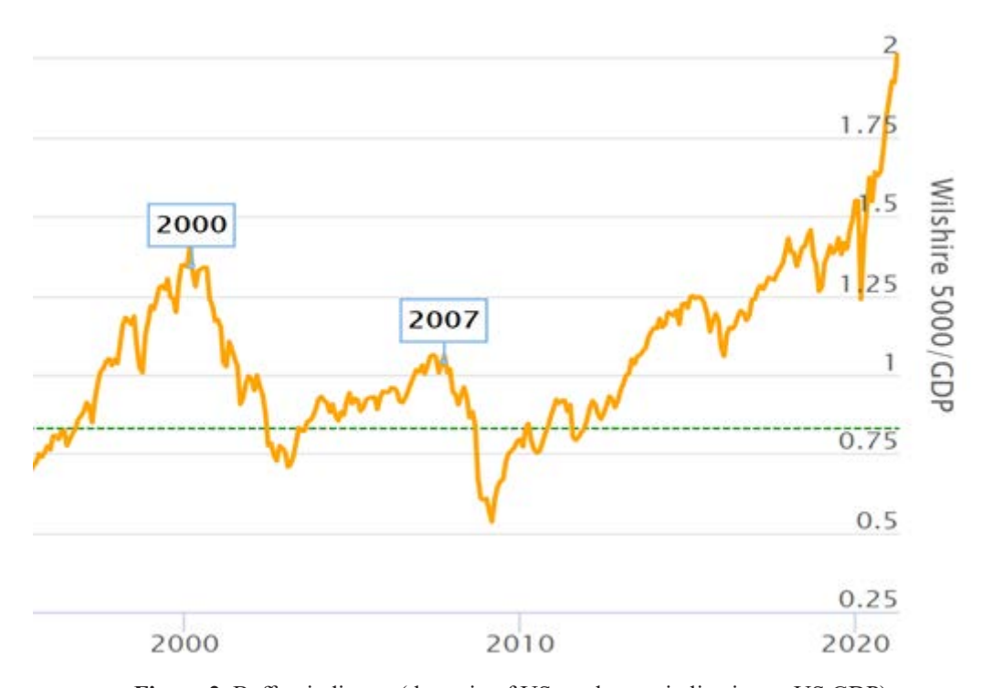
Figure 2. Buffett indicator (the ratio of US market capitalization to US GDP)

The liquidity emission, taking place on an particularly big scale, greatly decreases the likelihood of utilizing the indices of FA through investments' decision making. In the case of low discount rate application, the chances for gaining income are greatly confined. Whereas, acquiring a loan to purchase orations gets profit-earning. As a consequence, an international indicator, including the Buffett Indicator reveals incredibly high assessments of US stocks. Having said that, several US-based multinational organizations proceed to expand because of economic growth out of the nation (Figure 2).