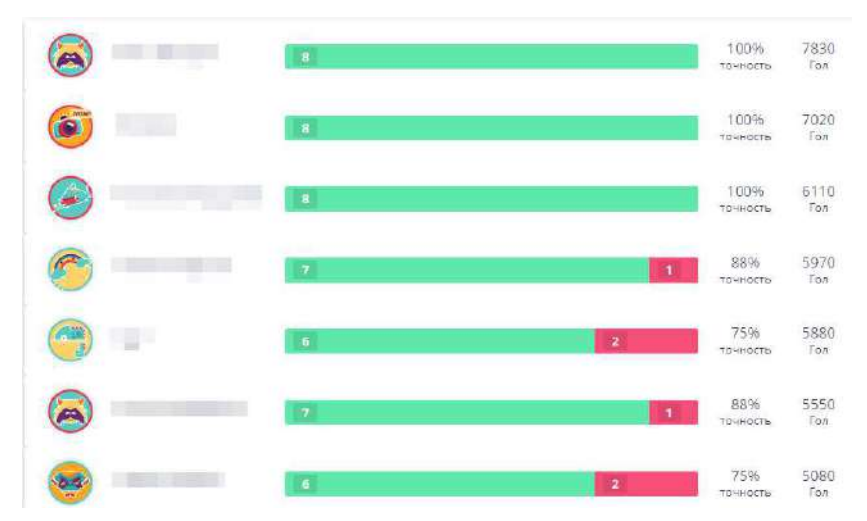
Fig. 1 Example of a report on completed tasks on the platform

Here are examples of exercises in the "test yourself" mode that were developed and applied at various stages of the course: